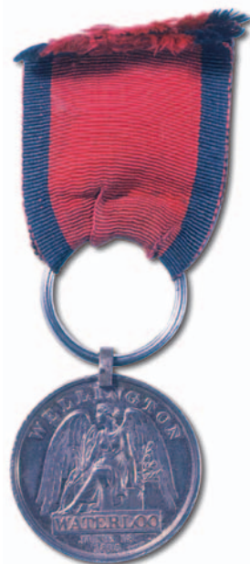
▲ British soldiers who fought at the battle of Waterloo received this medal.

Without doubt, Napoleon was a military genius and a brilliant administrator. Yet all his victories and other achievements must be measured against the millions of lives that were lost in his wars. The French writer Alexis de Tocqueville summed up Napoleon's character by saying, "He was as great as a man can be without virtue." Napoleon's defeat opened the door for the freed European countries to establish a new order.