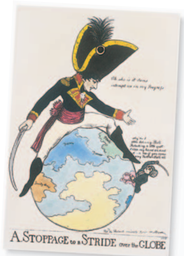
▲ "Little Johnny Bull"—Great Britain—waves a sword at Napoleon as the emperor straddles the globe.