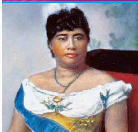
Queen Liliuokalani 1838–1917

Liliuokalani was Hawaii's only queen and the last monarch of Hawaii. She bitterly regretted her brother's loss of power to American planters and worked to regain power for the Hawaiian monarchy. As queen, she refused to renew a treaty signed by her brother that would have given commercial privileges to foreign businessmen. It was a decision that would cost her the crown.