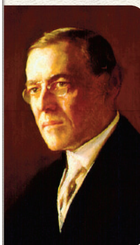
Woodrow Wilson 1856–1924

Wilson was tall and thin and often in poor health. He suffered from terrible indigestion and sometimes had to use a stomach pump on himself. A scholarly man, Wilson once served as president of Princeton University in New Jersey.