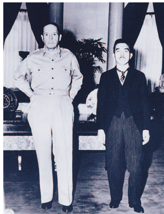
▲ Emperor Hirohito and U.S. General Douglas MacArthur look distant and uncomfortable as they pose here.

The new constitution was the most important achievement of the occupation. It brought deep changes to Japanese society. A long Japanese tradition had viewed the emperor as divine. He was also an absolute ruler whose will was law. The emperor now had to declare that he was not divine. That admission was as shocking to the Japanese as defeat. His power was also dramatically reduced. Like the ruler of Great Britain, the emperor became largely a figurehead—a symbol of Japan. C