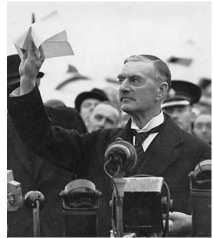
▲ Chamberlain waves the statement he read following the Munich Conference.

When Chamberlain returned to London, he told cheering crowds, "I believe it is peace for our time." Winston Churchill, then a member of the British Parliament, strongly disagreed. He opposed the appeasement policy and gloomily warned of its consequences: